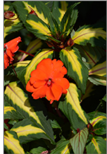
SunPatiens Spreading Tropical Orange New Guinea Impatiens flowers

SunPatiens Spreading Tropical Orange New Guinea Impatiens is recommended for the following landscape applications;