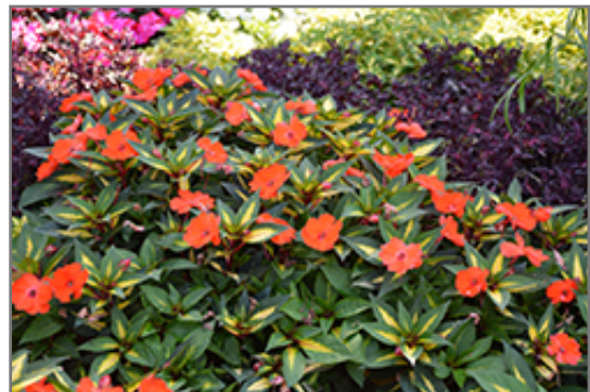
SunPatiens Spreading Tropical Orange New Guinea Impatiens in bloom