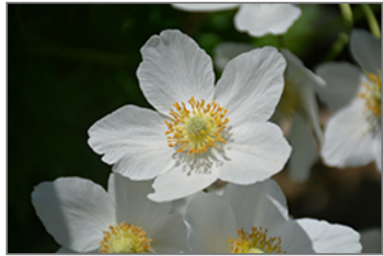
Windflower flowers

Windflower is recommended for the following landscape applications;