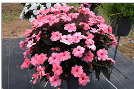
SunPatiens Compact Coral Pink New Guinea Impatiens in bloom