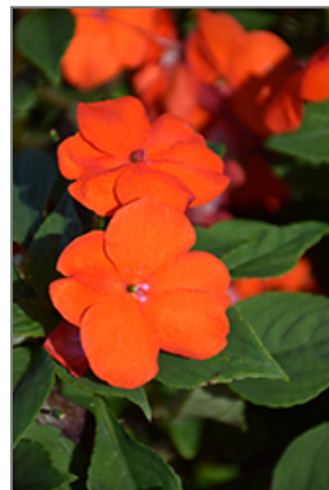
Lollipop Orange Impatiens flowers