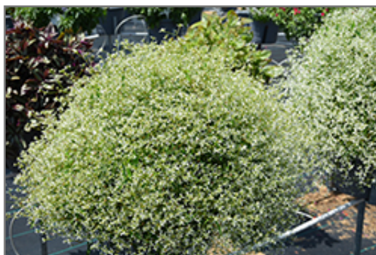
Glitz Euphorbia in bloom