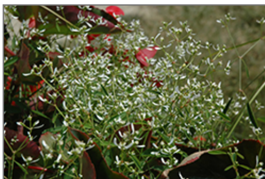
Glitz Euphorbia flowers