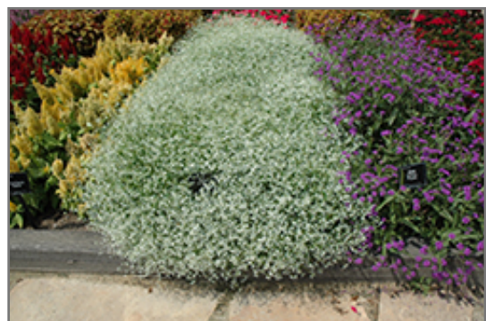
Glamour Euphorbia in bloom