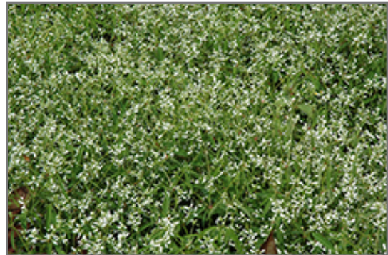
Glamour Euphorbia flowers