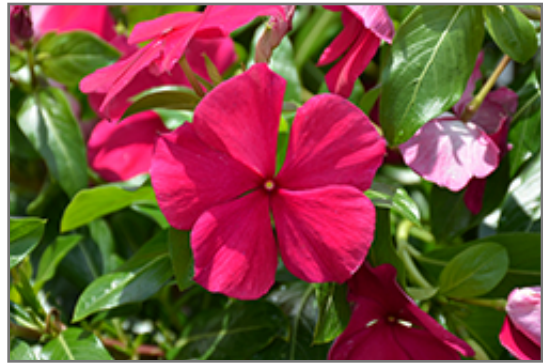
Valiant Burgundy Vinca flowers

Valiant Burgundy Vinca will grow to be about 12 inches tall at maturity, with a spread of 18 inches. Its foliage tends to remain dense right to the ground, not requiring facer plants in front. Although it's not a true annual, this fast-growing plant can be expected to behave as an annual in our climate if left outdoors over the winter, usually needing replacement the following year. As such, gardeners should take into consideration that it will perform differently than it would in its native habitat.