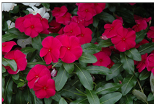
Valiant Burgundy Vinca flowers

Valiant Burgundy Vinca is recommended for the following landscape applications;