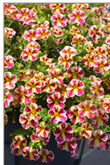
Superbells Holy Moly! Calibrachoa flowers

Superbells Holy Moly! Calibrachoa is recommended for the following landscape applications;