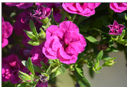
MiniFamous Double Purple Calibrachoa flowers