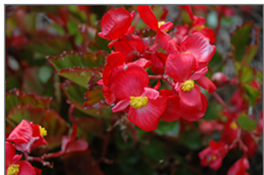
BabyWing Red Begonia flowers