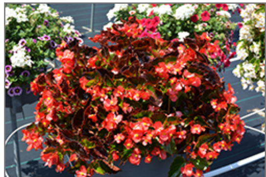
BabyWing Red Begonia in bloom