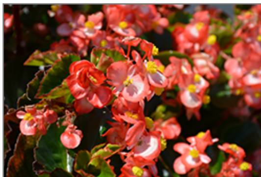
BabyWing Bicolor Begonia flowers