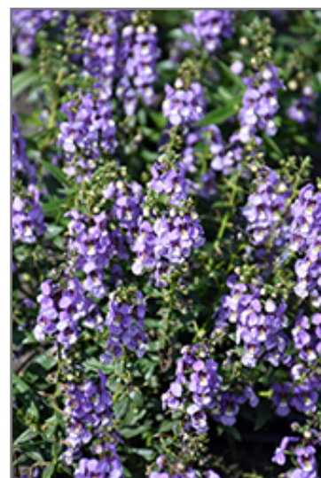
Serenita Sky Blue Angelonia flowers

This plant will require occasional maintenance and upkeep, and should not require much pruning, except when necessary, such as to remove dieback. It is a good choice for attracting butterflies to your yard, but is not particularly attractive to deer who tend to leave it alone in favor of tastier treats. It has no significant negative characteristics.