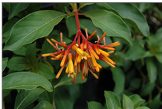
Dwarf Firebush flowers