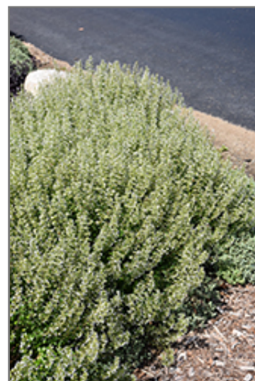
White Cloud Dwarf Calamint in bloom