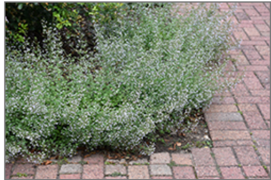
Blue Cloud Dwarf Calamint in bloom