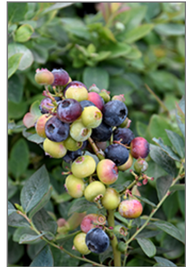
Pink Icing Blueberry fruit

This is a multi-stemmed deciduous shrub with an upright spreading habit of growth. Its relatively fine texture sets it apart from other landscape plants with less refined foliage. This is a relatively low maintenance plant, and usually looks its best without pruning, although it will tolerate pruning. It is a good choice for attracting birds to your yard. It has no significant negative characteristics.