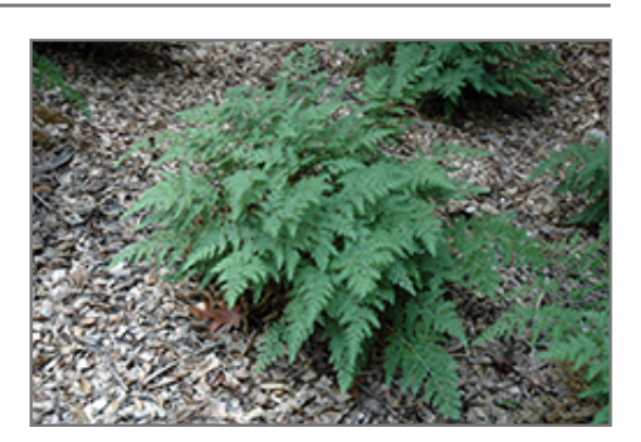
Braun's Spikemoss