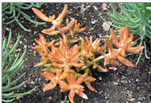
Coppertone Stonecrop