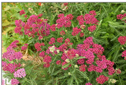
Cerise Queen Yarrow flowers