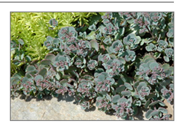
Cola Cola Stonecrop