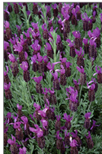
Anouk Supreme Spanish Lavender flowers

Anouk Supreme Spanish Lavender is recommended for the following landscape applications;