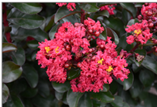
Cherry Mocha Crapemyrtle flowers