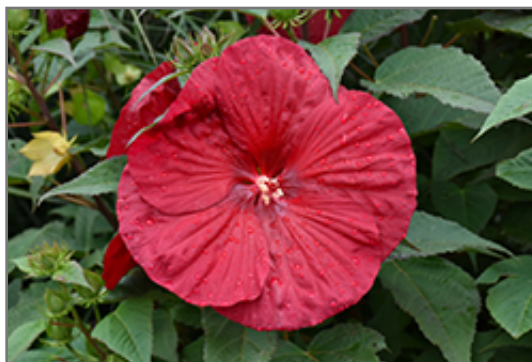
Vintage Wine Hibiscus flowers

Vintage Wine Hibiscus is recommended for the following landscape applications;