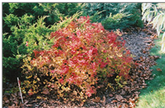
Golden Princess Spirea in fall

Golden Princess Spirea will grow to be about 3 feet tall at maturity, with a spread of 4 feet. It tends to fill out right to the ground and therefore doesn't necessarily require facer plants in front. It grows at a fast rate, and under ideal conditions can be expected to live for approximately 20 years.