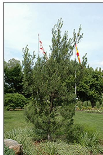
Twisted White Pine