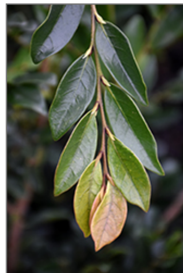
Linebacker Evergreen Distylium foliage