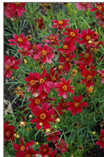
Red Satin Tickseed flowers