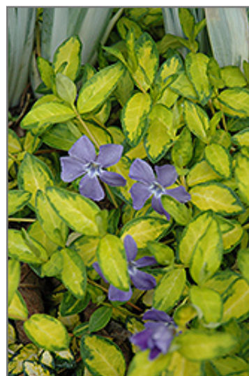
Illumination Periwinkle flowers