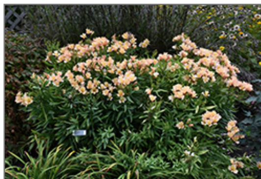
Inca Ice Alstroemeria in bloom