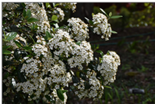
Conoy Viburnum flowers

Conoy Viburnum will grow to be about 4 feet tall at maturity, with a spread of 6 feet. It has a low canopy with a typical clearance of 1 foot from the ground. It grows at a medium rate, and under ideal conditions can be expected to live for 40 years or more.