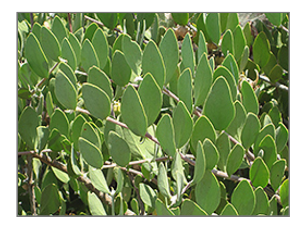
Jojoba foliage

This is a relatively low maintenance shrub, and can be pruned at anytime. It is a good choice for attracting birds and squirrels to your yard. It has no significant negative characteristics.