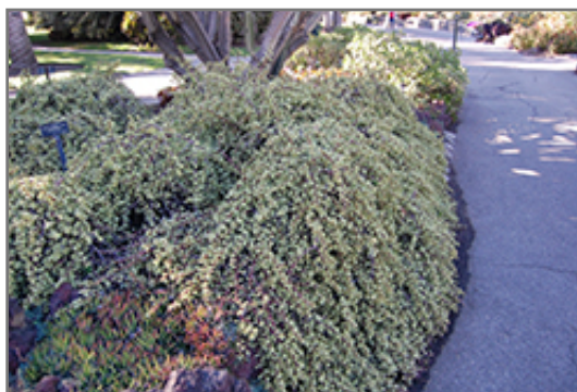
Variegated Elephant Food