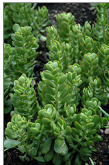
Red Carpet Stonecrop