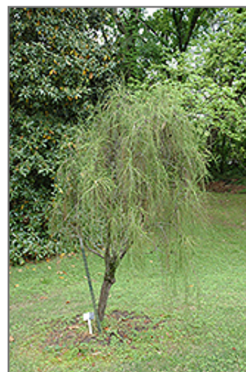
Threadleaf Arborvitae