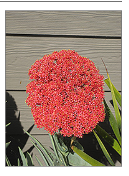
Airplane Plant flowers

Airplane Plant is recommended for the following landscape applications;