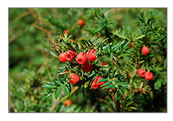
Canadian Yew fruit