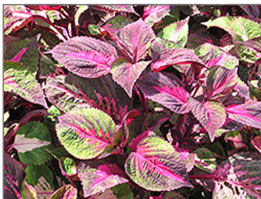
Magellanica Perilla foliage