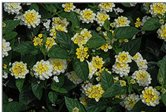
Lucky Lemon Glow Lantana flowers