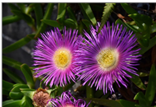
Trailing Iceplant flowers