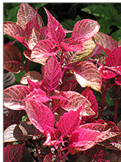
Linden's Blood Leaf foliage