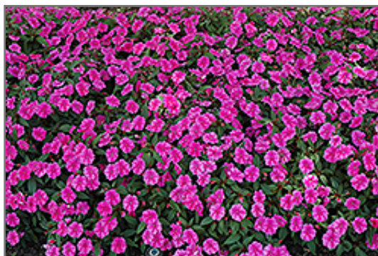
Bounce Pink Flame Impatiens in bloom