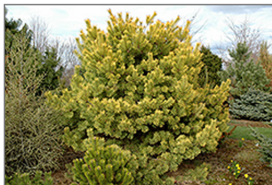
Golden Scotch Pine