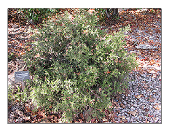
Rosemary Grevillea