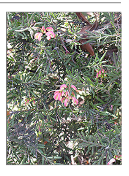
Rosemary Grevillea flowers