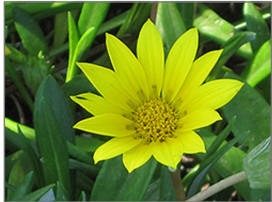
Trailing Gazania flowers