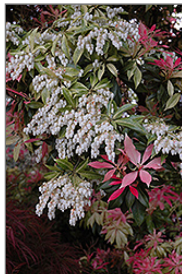
Valley Fire Japanese Pieris flowers