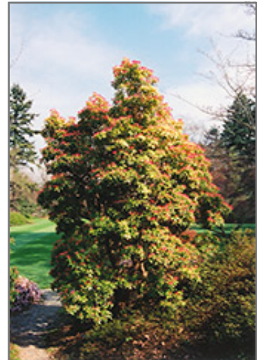
Valley Fire Japanese Pieris

This shrub does best in full sun to partial shade. It requires an evenly moist well-drained soil for optimal growth, but will die in standing water. It is very fussy about its soil conditions and must have rich, acidic soils to ensure success, and is subject to chlorosis (yellowing) of the foliage in alkaline soils. It is somewhat tolerant of urban pollution, and will benefit from being planted in a relatively sheltered location. Consider applying a thick mulch around the root zone in winter to protect it in exposed locations or colder microclimates. This is a selected variety of a species not originally from North America, and parts of it are known to be toxic to humans and animals, so care should be exercised in planting it around children and pets.