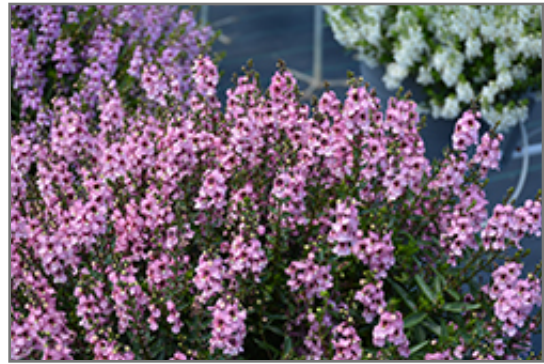
Serenita Pink Angelonia in bloom

Serenita Pink Angelonia is a fine choice for the garden, but it is also a good selection for planting in outdoor containers and hanging baskets. It is often used as a 'filler' in the 'spiller-thriller-filler' container combination, providing a mass of flowers against which the larger thriller plants stand out. Note that when growing plants in outdoor containers and baskets, they may require more frequent waterings than they would in the yard or garden.