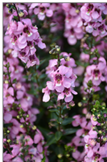
Serenita Pink Angelonia flowers