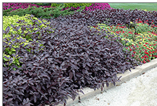
Purple Knight Alternanthera