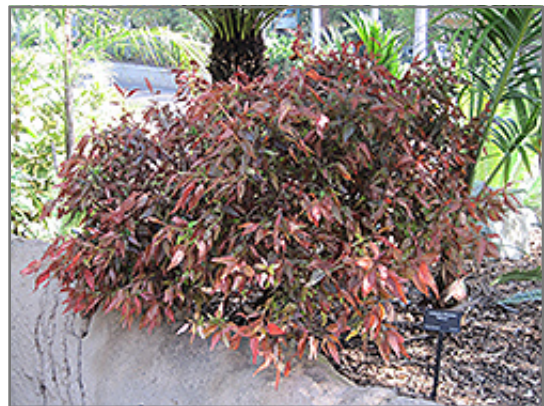
Inferno Copper Plant