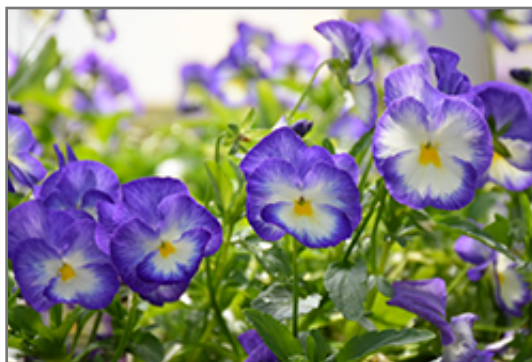
Halo Lilac Pansy flowers

Halo Lilac Pansy is recommended for the following landscape applications;