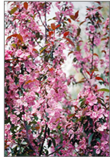
Shaughnessy Cohen Flowering Crab flowers